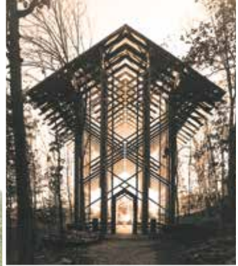
Thorncrown Chapel near Eureka Springs, Arkansas; Fay Jones + Maurice Jennings Architects