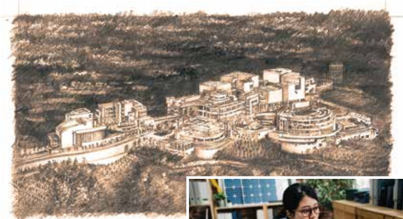
Getty Center, Los Angeles, California; Richard Meier, architect